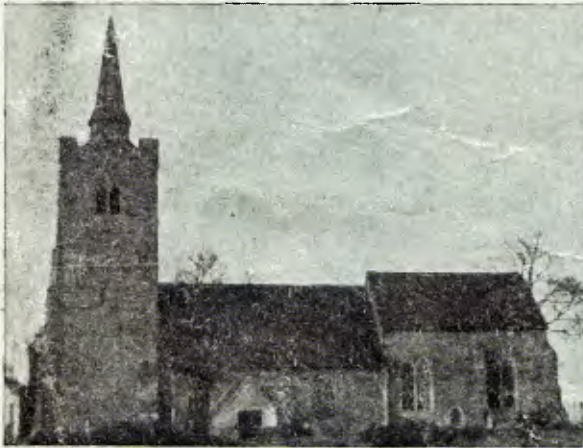
ALL SAINTS'. BARLING MAGNA