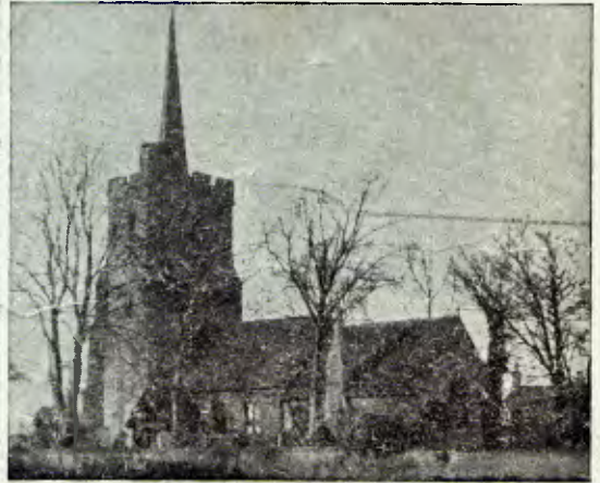
ST. MARY THE VIRGIN, LITTLE WAKERING