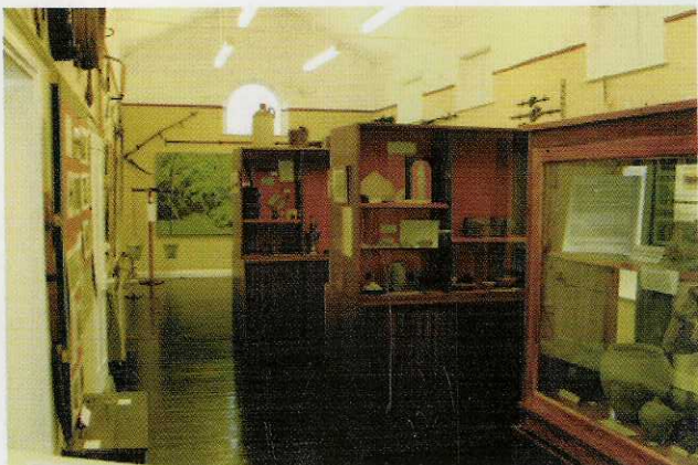
Part of the extensive display area

Displays include archaeological finds and study relating to the Romano-British Period and land reclamation during the Medieval Period on Foulness Island. Other displays show the island's flora and fauna and there is an extensive collection of tools and other artefacts from by-gone days, all donated by local inhabitants. The outcome is a diverse collection that shows a vivid picture of life over the ages on this unique and remote coastal habitat.